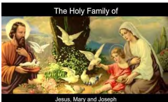
The Holy Family of